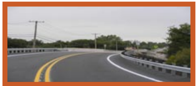
Bolcum Road Bridge (above)

Please feel free to call me at my office if you have any concerns.