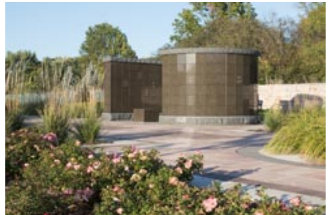
The Columbarium at Union Cemetery

Cement flower pots that are not maintained for a summer season will be moved to the Cemetery Office at Union Cemetery, 1206 N. 5th Avenue. Contact the Cemetery Office for more information at 630-584-8699.